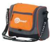
Carrying case WAFUTM6